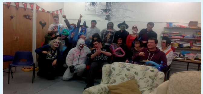
Above - Halloween fancy dress party.