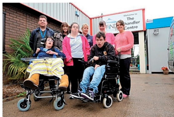
Right - Staff & Students outside the Chandler Centre.

The recent weeks have seen the development of FiND2's greenhouse and sensory garden.